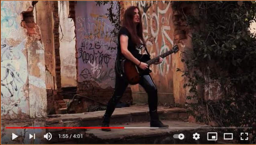
The Damnnation - Apocalypse